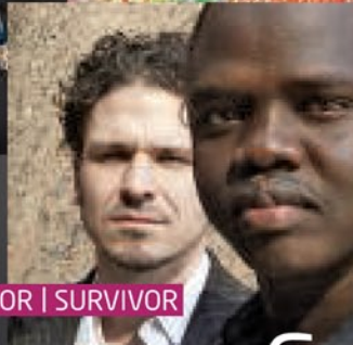
AUTHOR | SURVIVOR